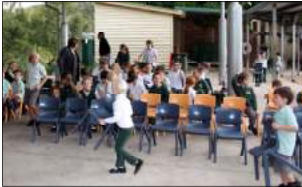
Everyone helps setting up