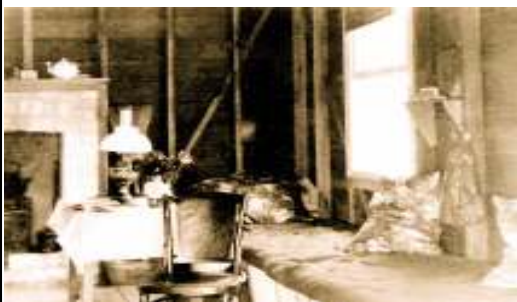
Rare interior photo San Toy Estate 1930