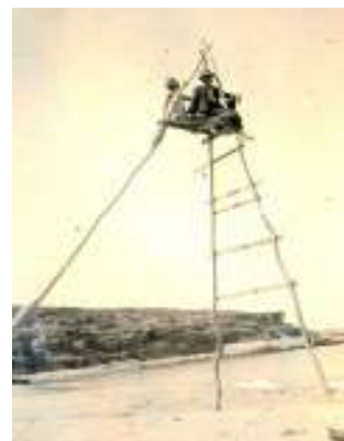
Fish Spotting Putty Beach 1930

All of these stories can be included in one or more CDs and made available at low cost to local residents and also placed in library collections. We will also produce a DVD at low cost which will include interviews with local people who have lived here from the 1930's on. The film will include photos of earlier days juxtaposed with modern day images. Finally we plan to produce a professionally printed book which will select material from our general research and turn it into a book which every local resident and visitor will want to have on their coffee table.